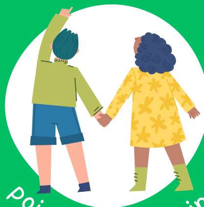
pointing or showing